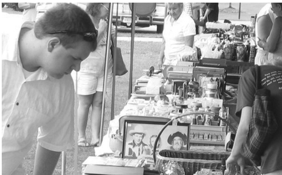
With up to 70 vendors, the Flea Market in Boyne City this weekend features a huge variety of unique and value-priced selections...find a gift for a loved one and take home something for yourself as well!

BCAntiqueAutoShow2013Photo1; Prepare your engines this weekend for Boyne City's 40th Annual Antique Auto Show! The event will be held on Saturday, August 10th from 9 am to 3 pm at Veterans Memorial Park on Lake Street.