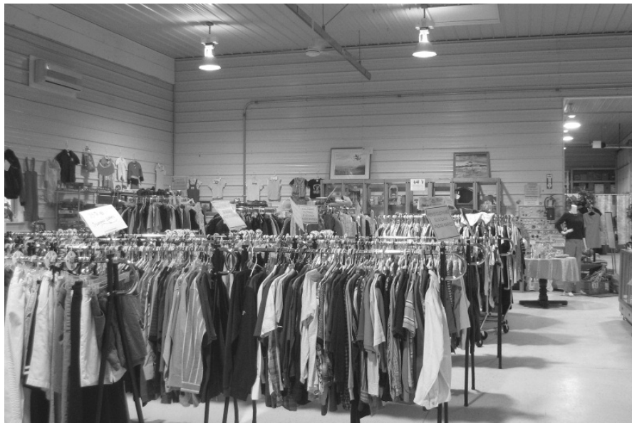
The Bergmann Center Resale Shop offers terrific bargains on resale goods ranging from clothing, furniture and other household items, to one-of-a-kind new products created by local individuals.

What many may not be aware of is that starting in August of 2010, The Bergmann Center opened a fantastic Resale Shop located right next to their main facility on Ance Road, offering terrific bargains on resale goods ranging from clothing, furniture and other household items, to one-of-a-kind new products created by local individuals.